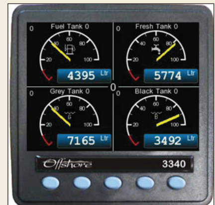
3340 Color MultiFunction Display